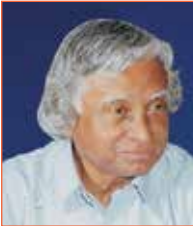
Bharat Ratna Dr A. P. J. Abdul Kalam Former President of India