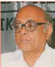
Padma Vibhushan Dr. R. Chidambaram Principal Scientific Advisor to the Government of India