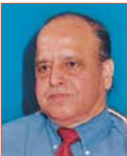
Padma Vibhushan Dr. K. Kasturirangan Ex-Chairman, ISRO, Former member of Parliament, Member Planning Commission & our alumnus and former teacher